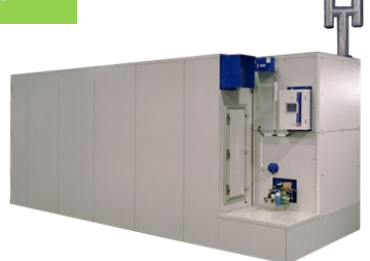
Leaf tobacco dryer

<u>Products: Leaf tobacco dryer, Rising seeding material, Fertilizer, Agricultural chemicals</u>