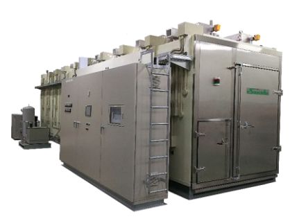
Vapor heat treatment system

Constant temperature vapor treatment system machine (CTVT)